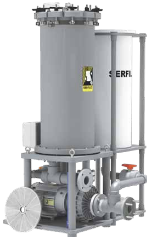
*See bulletin F-304 for Mega-Flo Filter Systems