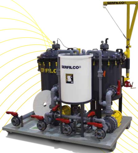
*See bulletin F-405 for Opti-Flo Filter Systems