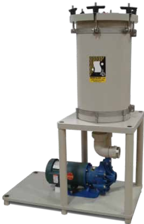
*See bulletin F-231 for 'FM' Filter Systems