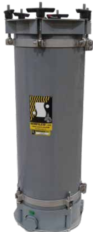
*See bulletin C-107 for Series 'G' Filter Chambers