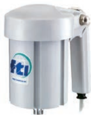
ODP (S1, S2, S3, S6*)