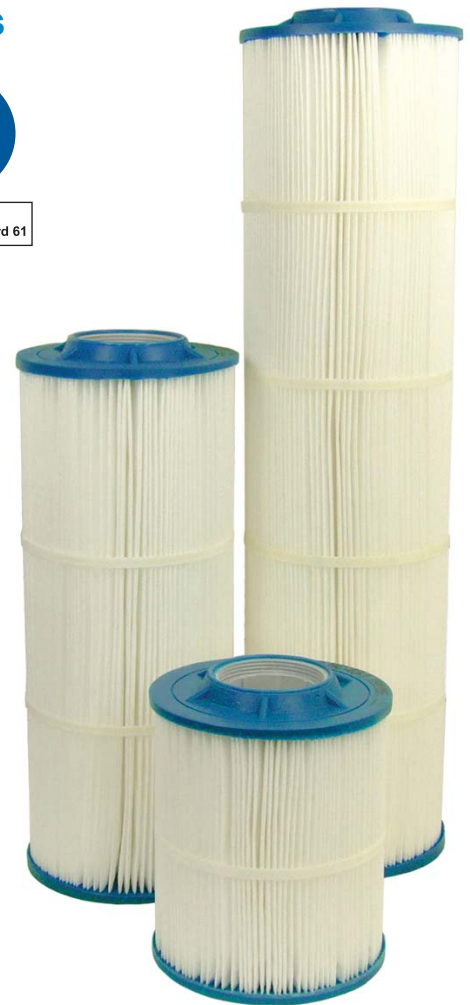
Premium Hurricane® Harmsco-Free Cartridges