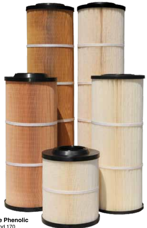
Cellulose Phenolic 90 and 170