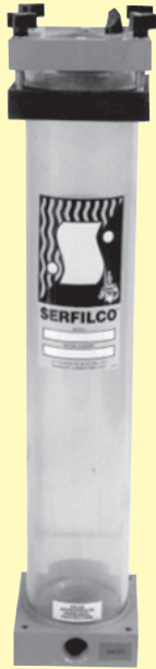
SERIES 'L' Bulk Resin