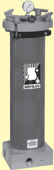
SERIES 'S' Bulk Resin or Canister