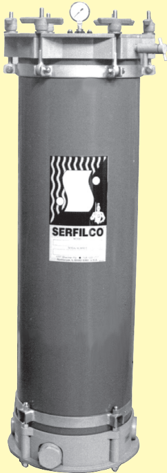
SERIES 'G' Bulk Resin or Canister