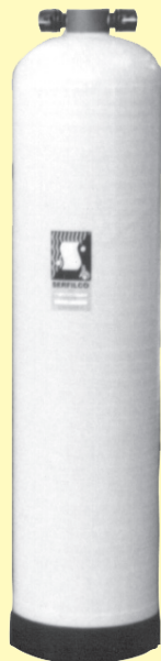
SERIES 'GR' Bulk Resin