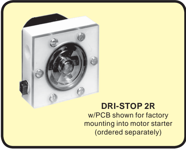
DRI-STOP 2R w/PCB shown for factory mounting into motor starter (ordered separately)